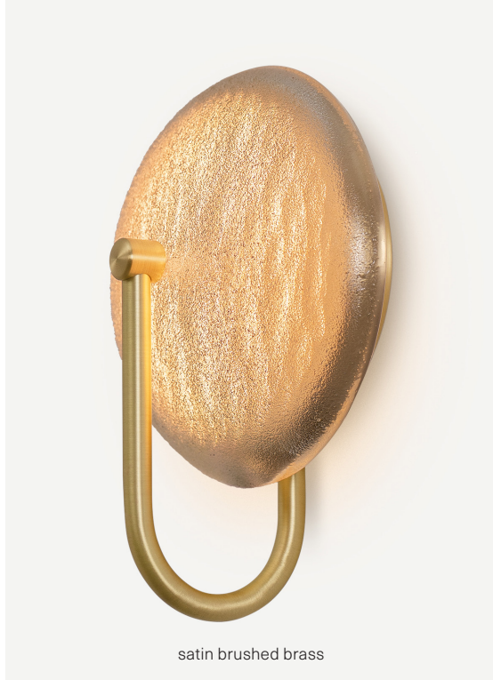
satin brushed brass