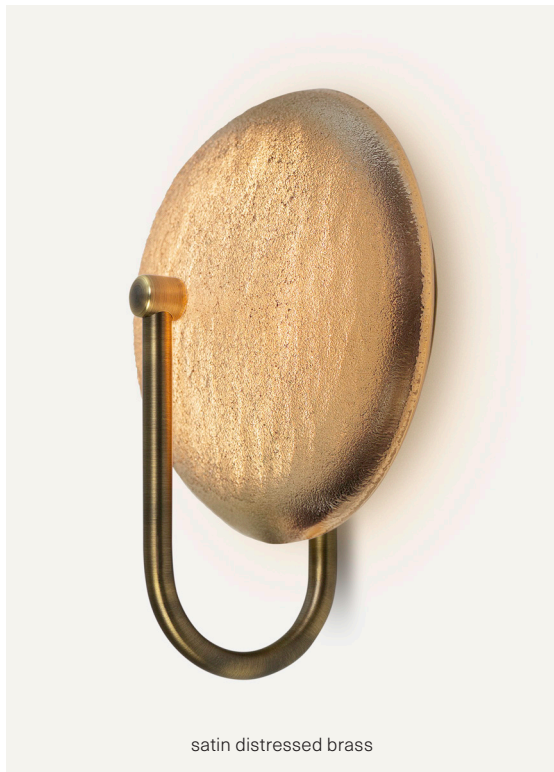
satin distressed brass