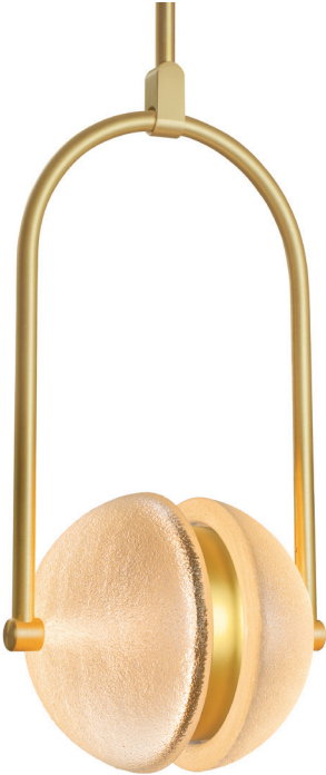
satin brushed brass