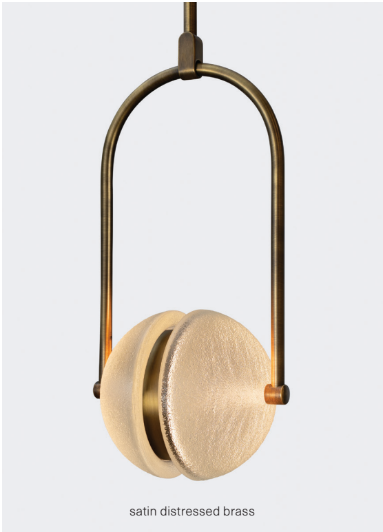
satin distressed brass

Siemon & Salazar's latest pendant utilizes the ancient technique of sand casting, which creates a tactile texture on the glass that also helps diffuse the light. A hand-formed brass armature joins the two hemispherical pieces of glass. The design is beautiful, possessing a sense of elegant jewelry while also being functional.